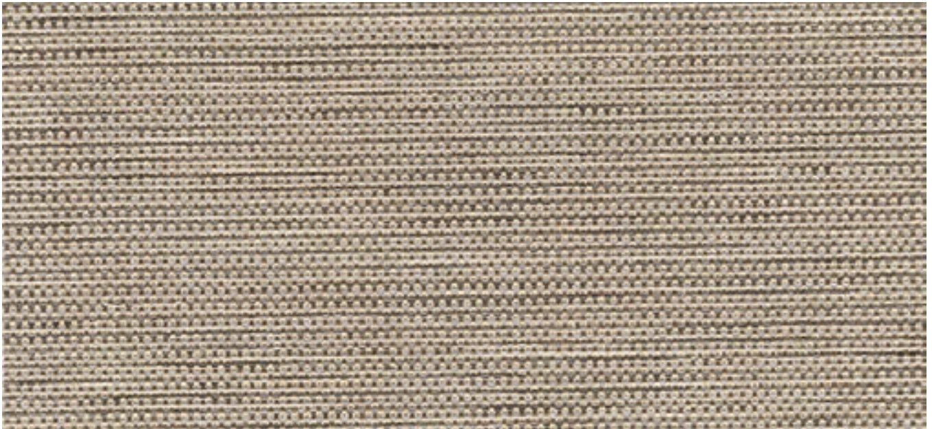
IRON ORE 39-12