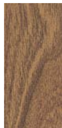
199 Cherry Oak

Not suitable as a tackable surface. Larger samples are available. Contact your Hufcor Distributor for information about additional colors or patterns. Minimum quantities and extended lead times may apply.