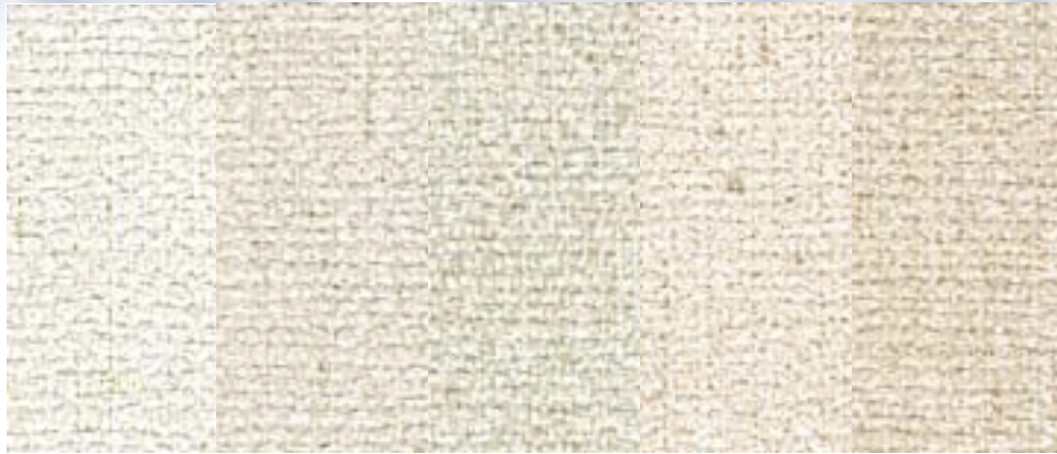
231 White Rice

HIGHLAND Recommended for use on a tackable surface. The embossed surface helps to conceal pin holes. Pattern is a random match. Larger samples are available. Please contact your Hufcor Distributor.