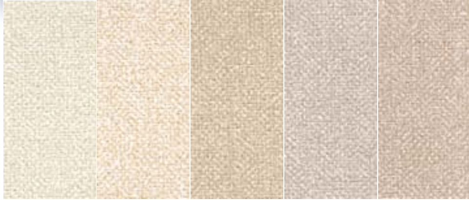
239 Dover (C)

CAIRN Not recommended for use on a tackable surface. The tack holes may become visible over time. Pattern is a random match. Larger samples are available. Please contact your Hufcor Distributor. Additional Cairn colors are available from the vinyl manufacturer; however, there will be an increase in price for a color not shown on this selector.